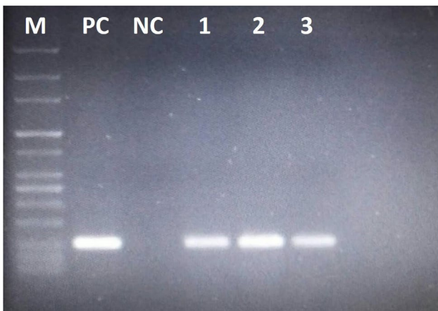
FIGURE 2 Results of the Fasciola hepatica IGS PCR on 1% agarose gel electrophoresis. M, Molecular weight 100bp marker; PC, Positive control; NC, Negative control; 1–3 positive samples for Fasciola hepatica

GREEN I fluorescent dye to the reaction tubes, 11 tubes (5.6%) showed green fluorescence indicated a positive result of F. hepatica infection (Figure 3a,b).