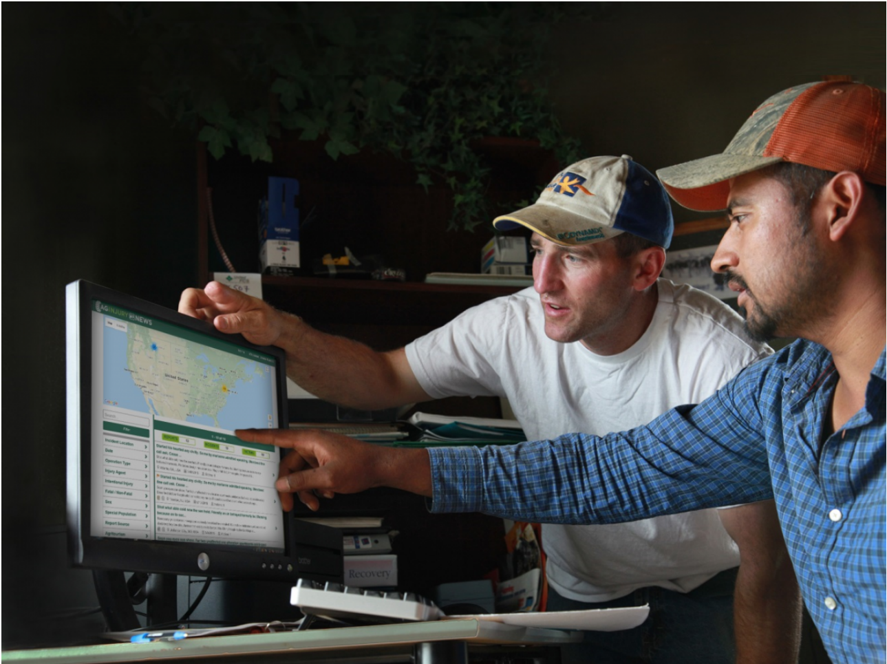
Figure 3. Farm owner and manager searching AgInjuryNews for local injury reports.