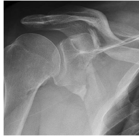
Fig. 3 This patient sustained 15-B2 clavicular and 14-A3.1 scapular fractures in a motorcycle accident

The mean follow-up was 16 months (12–45 months). The mean age at time of injury was 46 years (18–60 years) and 10 patients were male. High-energy mechanisms were the