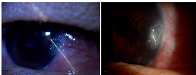
Figure 1 External and slit lamp photos of the left eye showing corneal ulceration.

were discussed with the patient. The topical antibiotic drops were stopped, and the patient was referred to her primary physician for long-term systemic management. The patient had no recurrence of keratitis or uveitis at 1 and 3 months follow-up in the ophthalmology clinic.