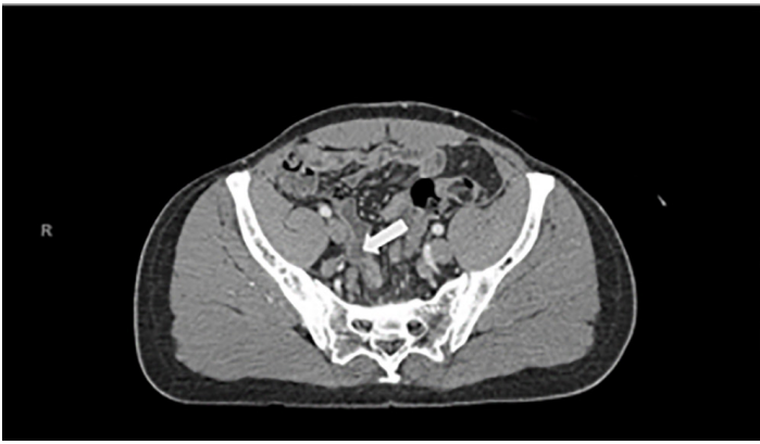
Image 1. Computed tomography abdomen and pelvis with intravenous contrast with the arrow pointing to a normal appendix.