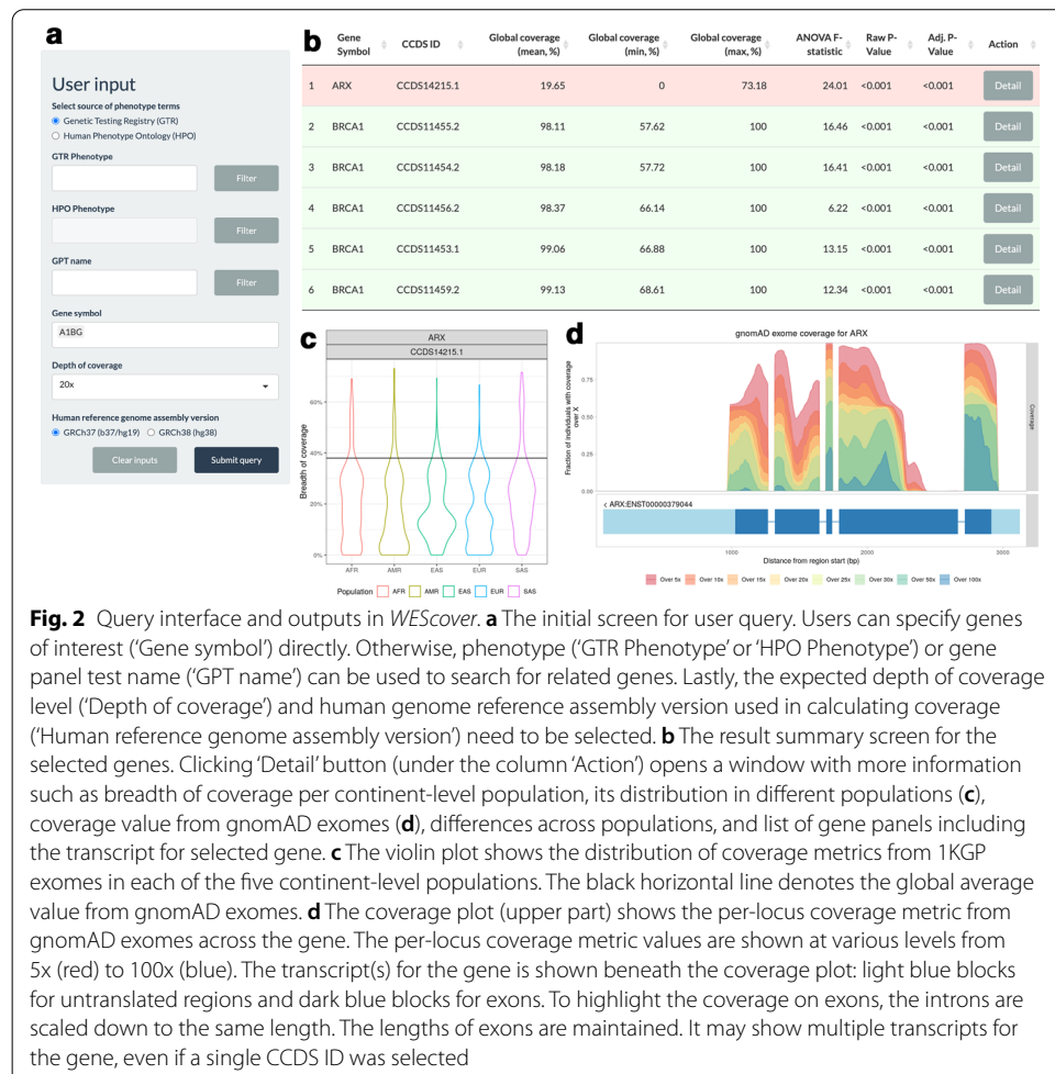
Fig. 2 Query interface and outputs in WEScover. a The initial screen for user query. Users can specify genes of interest ('Gene symbol') directly. Otherwise, phenotype ('GTR Phenotype' or 'HPO Phenotype') or gene panel test name ('GPT name') can be used to search for related genes. Lastly, the expected depth of coverage level ('Depth of coverage') and human genome reference assembly version used in calculating coverage ('Human reference genome assembly version') need to be selected. b The result summary screen for the selected genes. Clicking 'Detail' button (under the column 'Action') opens a window with more information such as breadth of coverage per continent-level population, its distribution in different populations ( c ), coverage value from gnomAD exomes ( d ), differences across populations, and list of gene panels including the transcript for selected gene. c The violin plot shows the distribution of coverage metrics from 1KGP exomes in each of the five continent-level populations. The black horizontal line denotes the global average value from gnomAD exomes. d The coverage plot (upper part) shows the per-locus coverage metric from gnomAD exomes across the gene. The per-locus coverage metric values are shown at various levels from 5x (red) to 100x (blue). The transcript(s) for the gene is shown beneath the coverage plot: light blue blocks for untranslated regions and dark blue blocks for exons. To highlight the coverage on exons, the introns are scaled down to the same length. The lengths of exons are maintained. It may show multiple transcripts for the gene, even if a single CCDS ID was selected

We collected the registered genetic tests listed in the National Institutes of Health Genetic Testing Registry (GTR) [15] to inform users of available genetic tests. Additionally, WEScover enables users to query phenotype to list candidate genes by integrating associated Human Phenotype Ontology (HPO) terms [17] for each genetic test from GTR. As of writing, a total of 59,928 genetic tests for both clinical and research usage