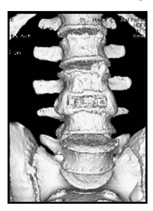
Fig. 2. Three-dimensional reconstruction showing fusion formation.

92-97% at 12 months after surgery, depending on fusion technique and graft material. These procedures were standalone ALIFs using threaded cages inserted either through an open approach or laparoscopically, using either iliac crest autograft or or bone morphogenic protein (rh-BMP) in the cages.