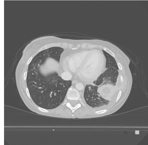
FIGURE 1: Pulmonary TC scan showing nocardial organized abscess in the left inferior lobe.

Two months after discharge, she was readmitted to the hospital due to an acute left chest pain, fever, and neutropenia (hemoglobin 8.9 g/dl, white blood cells 0.62 \times 10^9/L , neutrophils 0.34 \times 10^9/L , and platelets 21 \times 10^9/L ); chest computed tomographic scan showed a basal bilateral pneumonia associated with diffuse pulmonary nodules and bronchial obliteration. A microbiological examination of bronchoalveolar lavage proved the presence of a Nocardia spp. Despite targeted antibiotic therapy with high-dose sulfamethoxazole-trimethoprim in association with broad-spectrum and specific