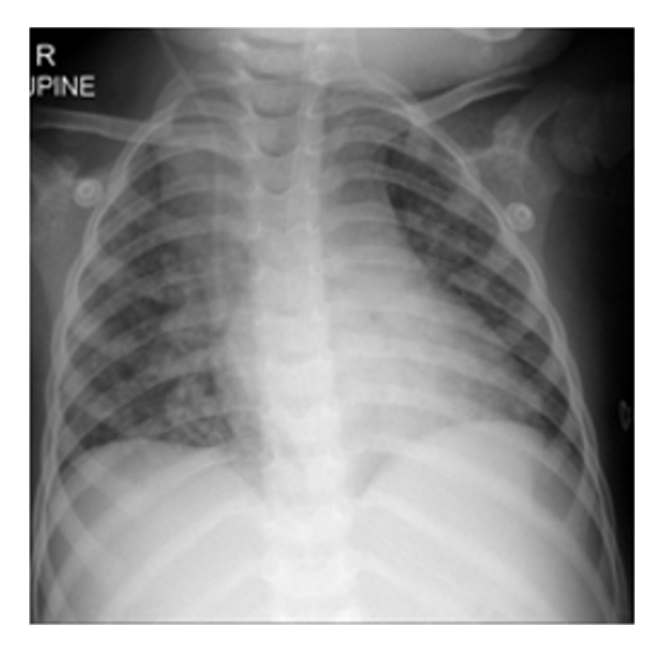
Figure 1 Chest radiograph demonstrated a reticulonodular pattern in keeping with miliary tuberculosis. A right-sided ventriculo-peritoneal shunt is visible.

kg, pyrazinamide 40 mg/kg and ethionamide 20 mg/kg, as well as prednisone (2 mg/kg). Aspirin 3 mg/kg/day was prescribed in lieu of the extensive CSVT. Shortly after admission, raised intracranial pressure necessitated insertion of ventriculoperitoneal shunt. Within 72 hours following admission, the child's respiratory status worsened that necessitated high dose dexamethasone (oral prednisone stopped), intravenous antibiotics and high flow nasal oxygen. During the recovery phase, she received speech, occupational and physiotherapy.