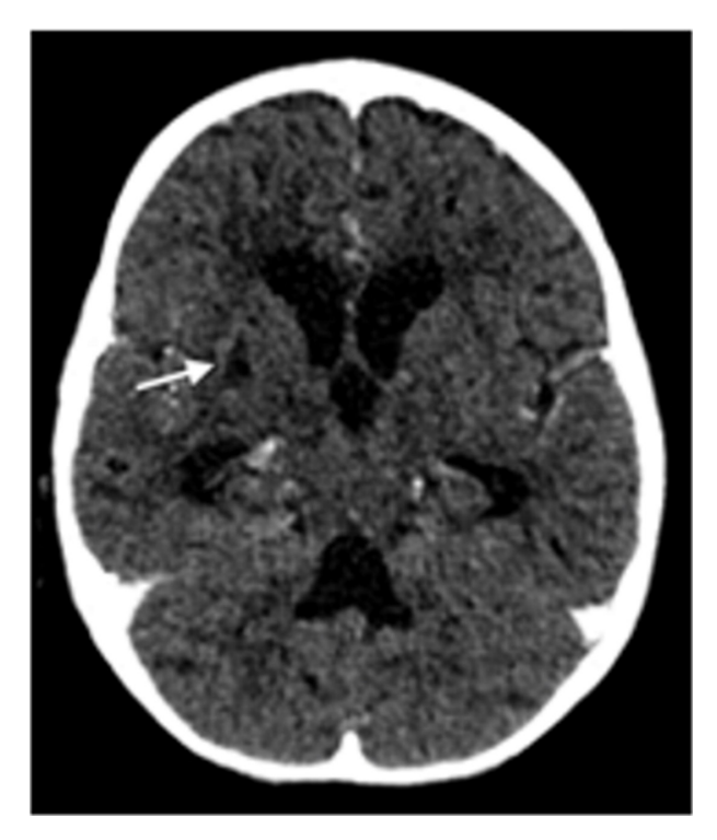
Figure 2 Axial contrasted CT showing infarction involving the right internal capsule extending to the lentiform nucleus (see arrow).

kg, pyrazinamide 40 mg/kg and ethionamide 20 mg/kg, as well as prednisone (2 mg/kg). Aspirin 3 mg/kg/day was prescribed in lieu of the extensive CSVT. Shortly after admission, raised intracranial pressure necessitated insertion of ventriculoperitoneal shunt. Within 72 hours following admission, the child's respiratory status worsened that necessitated high dose dexamethasone (oral prednisone stopped), intravenous antibiotics and high flow nasal oxygen. During the recovery phase, she received speech, occupational and physiotherapy.