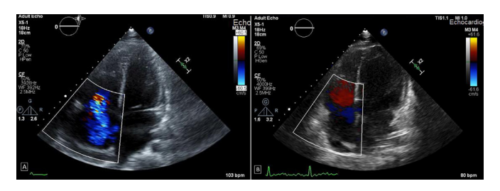
Figure 1 (A) Initial transthoracic echocardiogram showing the right atrium and ventricle moderately dilated. There was a thin rim of pericardial effusion. Severe tricuspid regurgitation. (B) Repeat transthoracic echocardiography after treatment with dexamethasone showing normal size of the right atrium and ventricle. Trace tricuspid regurgitation.

Further workup revealed evidence of renal impairment with significant proteinuria. An ECG showed sinus tachycardia with non-specific T-wave abnormalities, troponin-I was raised at 0.29 ng/mL and pro-BNP over 8000 pg/mL. A transthoracic echocardiogram showed severe tricuspid regurgitation with normal structure of the tricuspid valve. There was pulmonary hypertension, PASP of 46 mm Hg. The right atrium and ventricle were moderately dilated with normal systolic function. Left ventricle cavity size was normal with mildly reduced ejection fraction of 45%. There was a thin rim of pericardial effusion (figure 1A). A computed topography scan of the chest was negative for pulmonary embolism, however it showed evidence of