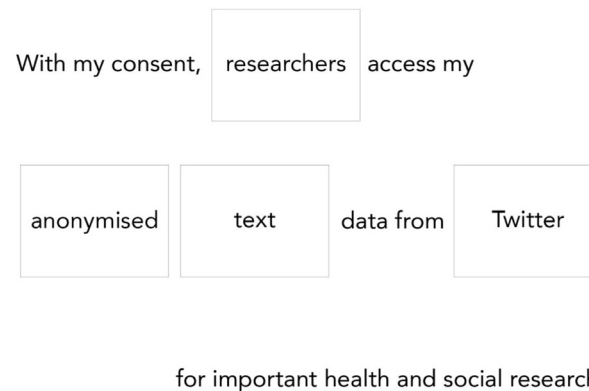
Figure 2. An example of a completed template from the situational exercise. This provides an example of how the templates were used during the focus groups to explore a particular situation in which their data might be accessed. Variation of the item in any one of the boxes could be changed to explore how this might alter the participant's opinion on the scenario.

minimise the bias in the selection of options, then discussed the scenarios in small groups of 4–5, with a facilitator moderating each group.