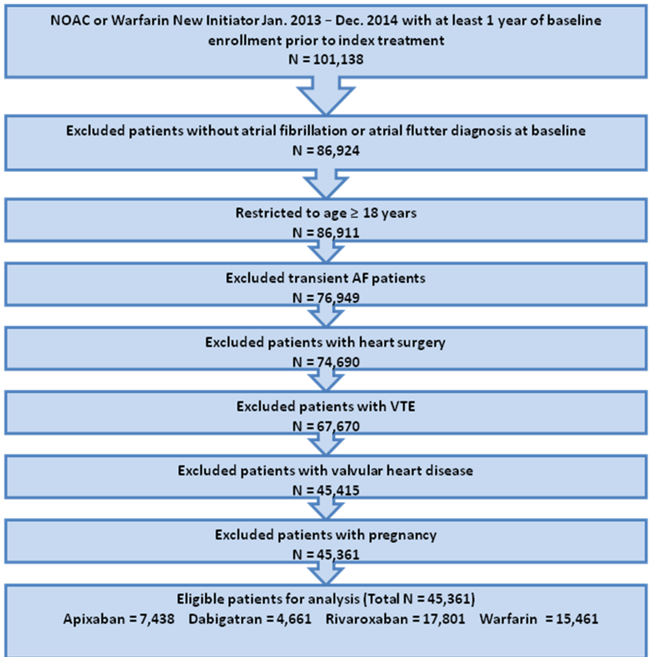
Fig 2. Patient selection criteria. Study population flow chart with inclusion and exclusion criteria used to select 45,361 patients. NOAC: non-vitamin K antagonist oral anticoagulant; VTE: venous thromboembolism.

https://doi.org/10.1371/journal.pone.0195950.g002