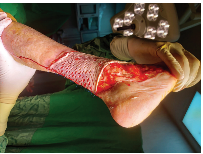
FIG. 5. Intraoperative image while grafting procedure

Since the beginning of 2020, the COVID-19 pandemic has been at the forefront of medical attention and research, with great strides being made in understanding this condition. By now, the typical disease presentation of fever, cough, and respiratory distress, along