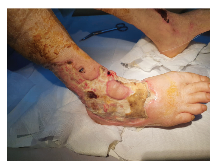
FIG. 2. Surgical debridement necrotic areas

SARS-COV2 infection through a real-time PCR test. A thoracic CT scan revealed left-sided ground glass opacity and pleural effusion, while head CT and Doppler ultrasound were normal, excluding giant-cell arteritis despite suggestive initial presentation.