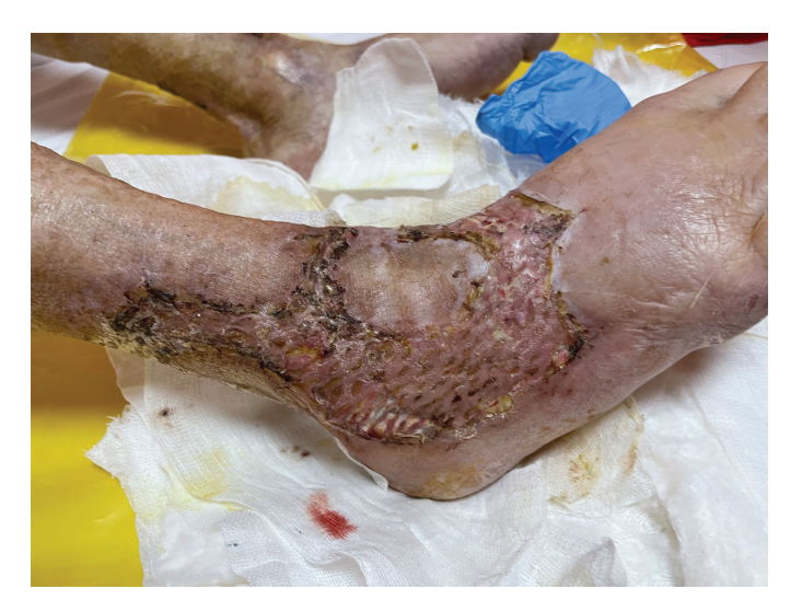
FIG. 6. Healing graft within recovery interval

with the predisposition toward thrombotic events, is familiar to all medical staff. However, atypical signs and symptoms are not uncommon, and the possible connection between this viral infection and vasculitis should not be ignored.