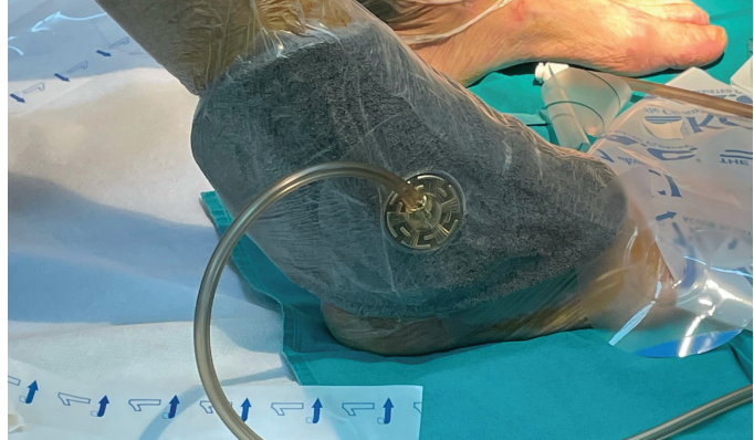
FIG. 3. Vacuum-assisted closure device on patient's lesion