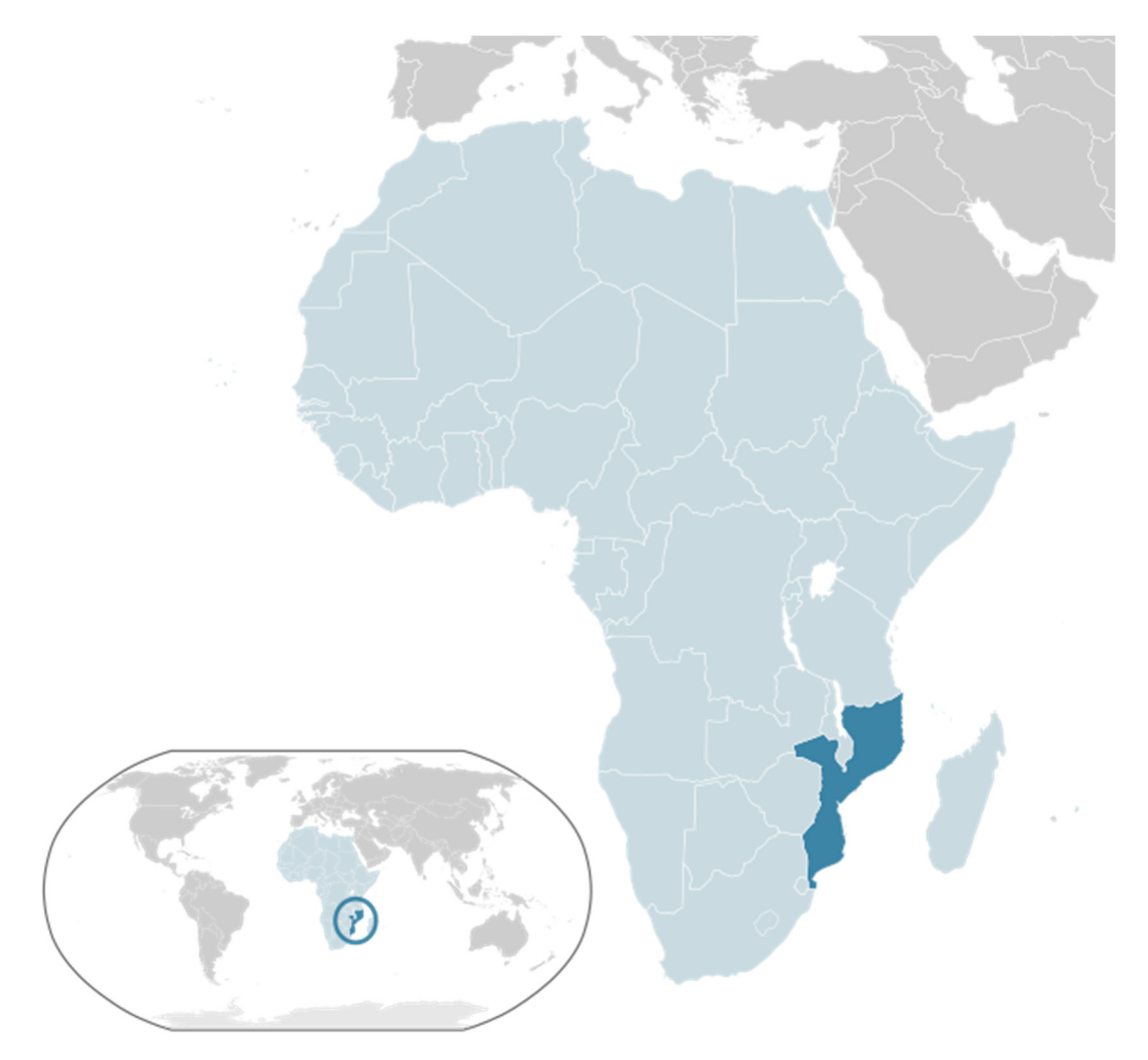
Figure 1. Location of Mozambique on the world map and in Africa.

The Republic of Mozambique (Figure 1) is located at the east coast of Southern Africa, with an area of 801,537 km<sup>2</sup> (25° 57′ S; 32° 35′ E), surrounded by South Africa and Eswatini (southwest), Zimbabwe and Zambia (west), Malawi (northwest) and Tanzania (north). The east side comprises a coastline (Indian Ocean) [26]. The capital, which is located on the southern coast, is Maputo City, and the official language is Portuguese [27].