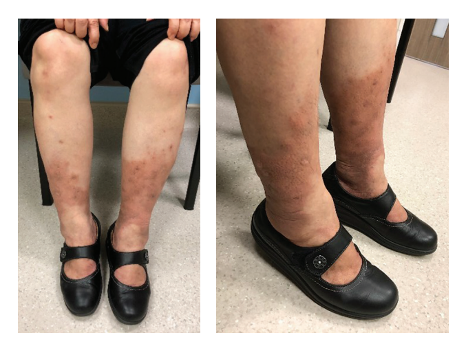
Figure 1. Images of the patient's pre-tibial myxedema (2018). Multiple skin-colored nodules and hyperpigmented plaques with 'peau d'orange appearance' over both shins.

In May 2016, she consulted a dermatologist for bilateral non-resolving, red, swollen, and itchy skin lesions on her lower limbs which had been present for a year. Cutaneous examination revealed presence of multiple skin-colored firm nodules over both shins, ranging in sizes from 1-2 cm in diameter. The underlying area was hyperpigmented up to mid-shin (Figure 1). This was initially diagnosed as eczema by her general practitioner prior to the consult. She was treated with multiple rounds of topical steroids and emollients without improvement. A left shin punch biopsy showed dermal mucinosis, consistent with pre-tibial myxedema (PTM). This was treated with intralesional steroid injections. There were no nail findings.