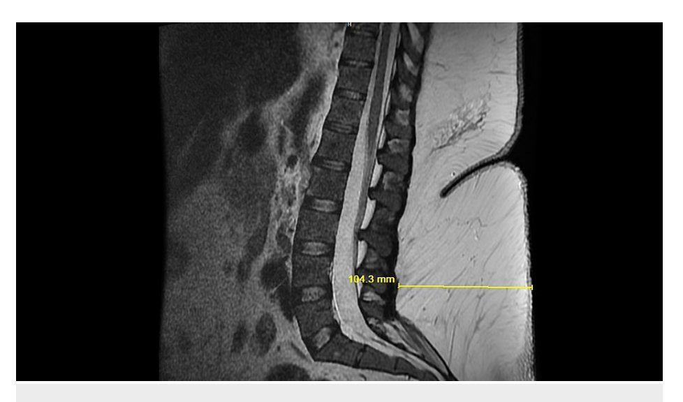
FIGURE 2: MRI Lumbosacral Spine

MRI lumbosacral spine showing 104.3 mm depth of nerve roots through subcutaneous tissues from the skin.