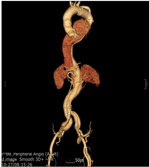
Fig. 1. The preoperative angiogram. From the anastomosis at the proximal descending aorta, the aortic dissection was enlarged to include both common iliac arteries.

in the true lumen of the dissected remnant of the thoracoabdominal aorta. The first stent graft was a 40×36 mm tapered monobody with a length of 20 cm, which was inserted into the proximal descending aorta covering the distal anastomosis of the previous aortic arch graft. The second stent graft was a 36×26 mm tapered monobody with a length of 16 cm, which was inserted into the first stent graft with an overlap of 4 cm. Finally, the third stent graft, a 26 mm monobody with a length of 16 cm, was inserted distally to cover the graft of the abdominal aorta. All stent grafts were inserted into the true lumen of the dissecting thoracoabdominal aorta and they covered approximately 40 cm of the length of the aorta.