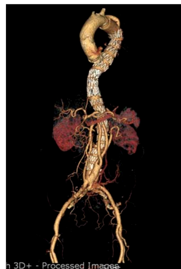
Fig. 3. The final computed tomography angiogram nine months after the operation. The entire enlarged pseudolumen of the aortic dissection had completely subsided. There was no endoleak and no restriction of perfusion.

So far, few hybrid thoracoabdominal aortic aneurysm repair procedures have been reported. Reported debranching techniques are quite diverse and have been mostly applied to high-risk patients such as those who are older, have comorbidities from heart, lung, or kidney disease, and have undergone prior open chest surgery. The hybrid repair strategy avoids repeating chest exposure and lung injury. In our case, the patient had already undergone an open thoracotomy to replace the proximal descending aorta, so we were concerned about the potential of subsequent lung injury and/or respiratory difficulty after reopening the adherent left thorax. Existing aortic grafts generally provide excellent landing