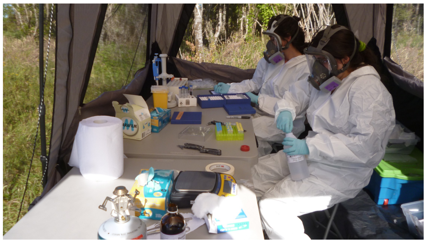
Fig 2. Central processing tent installed at each sampling site. Biosafety conditions during rodent handling were adapted to the risk of hantavirus cardiopulmonary syndrome.

https://doi.org/10.1371/journal.pntd.0007619.g002