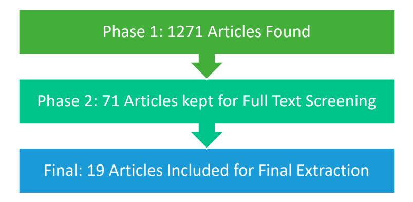
Figure 3. Flowchart of article screening.

After title and abstract screening arbitration, a total of 68 articles were included for full text screening. Three additional studies were added for full text screening from author knowledge. Each of these articles was screened by two reviewers with the same criteria used for title and abstract screening. Again, if any conflicts occurred in screening, all reviewers met to reconcile based on consensus. After arbitration, a total of 19 articles were included for final review and data extraction (Figure 3).