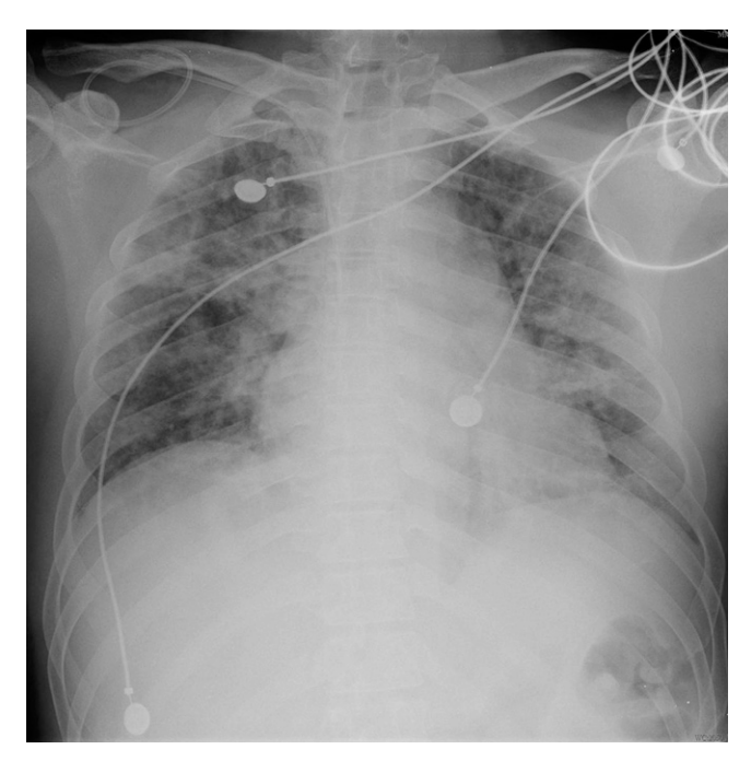
FIGURE 1. Chest roentgenography showing bilateral pneumonia with edema. Pneumonia with acute respiratory distress syndrome was suspected.

An immunocompetent 35-year-old male telecom company employee presented with fever and myalgia in early September 2009, a month after the moderate-strength Typhoon Morakot that caused a heavy rainfall in Taiwan. He was diagnosed with pneumonia with respiratory distress and shock (Figure 1). Intensive care with respiratory and inotropic support and broad-spectrum antibiotics with piperacillin/tazobactam were administered upon admission. He subsequently developed skin rash, conjunctival suffusion, and subconjunctival hemorrhage, which were suggestive of leptospirosis (Figures 2 and 3). Thus, empirical therapy with penicillin + ceftriaxone was initiated to treat leptospirosis and cover possible bacterial co-infection, although he could have been treated with either