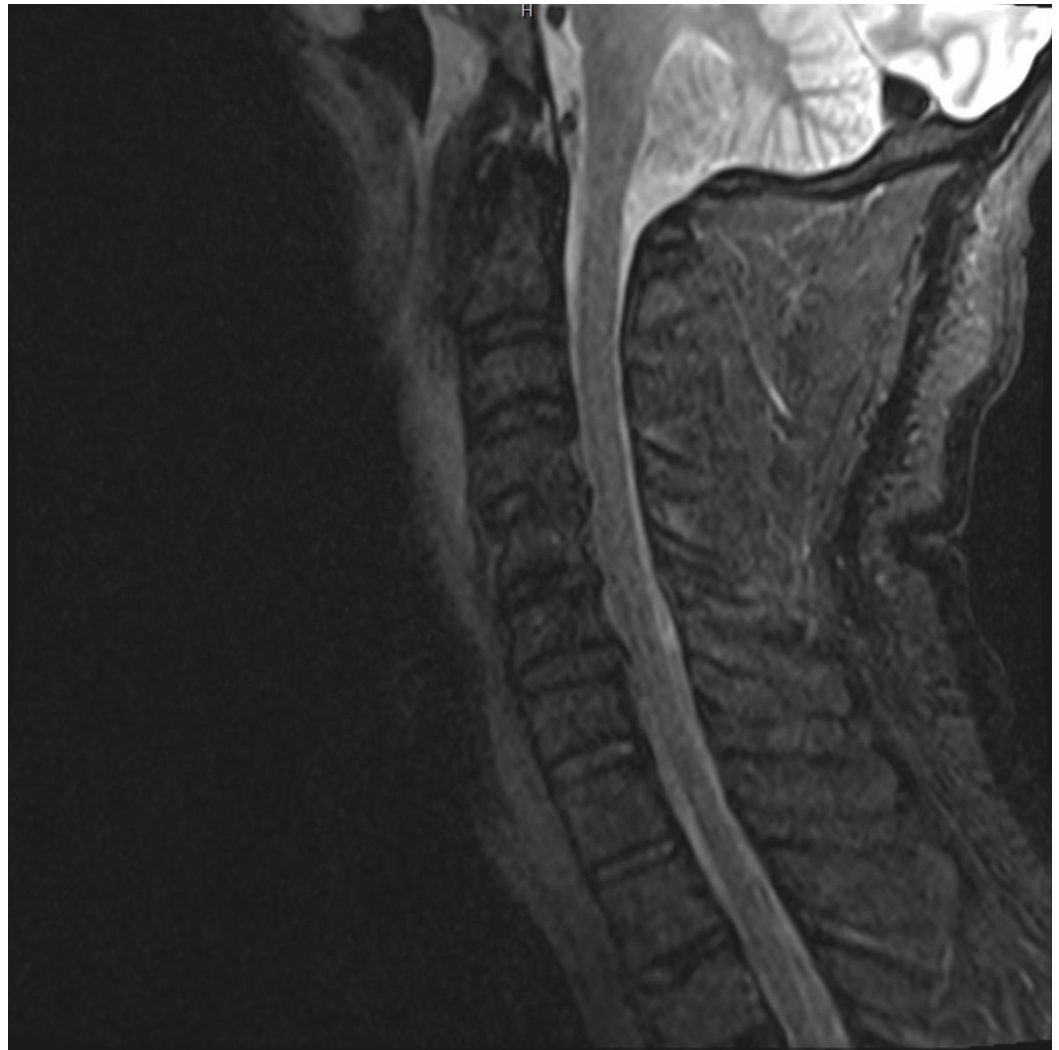
FIGURE 4: Magnetic Resonance Imaging of the Cervical Spine

Sagittal cervical spine short tau inversion recovery (STIR) sequence