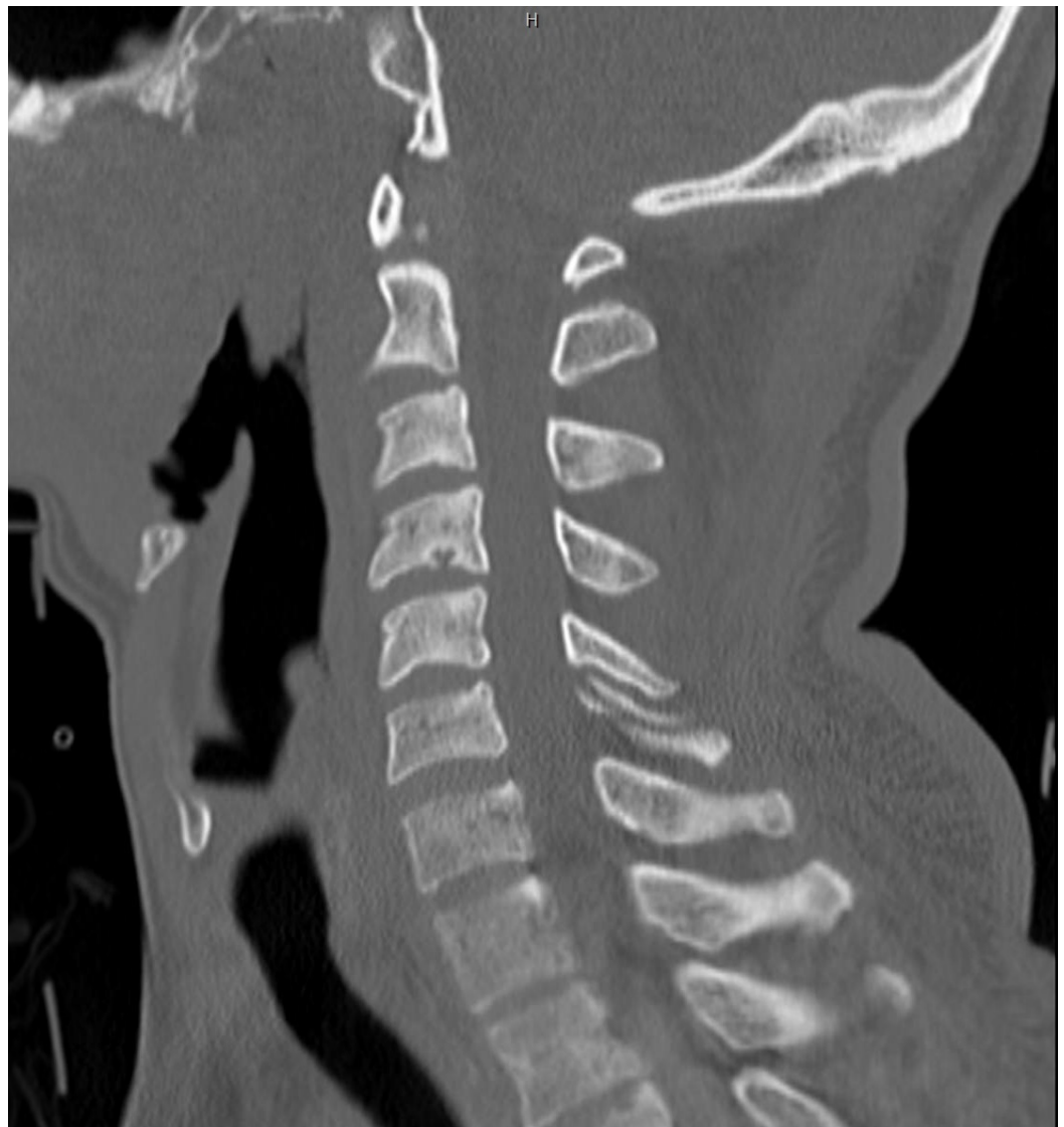
FIGURE 2: Computed Tomography Scan of the Cervical Spine

Midline sagittal imaging that shows a lack of anterolisthesis