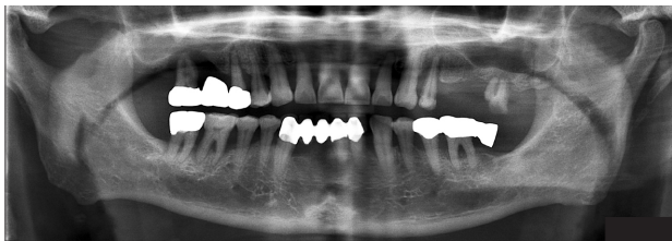
Fig. 2. Orthopantomogram view indicates chronic periodontitis of the right maxillary posterior teeth.

Jin Yong Cho et al: Cavernous sinus thrombosis progression from trismus. J Korean Assoc Oral Maxillofac Surg 2015