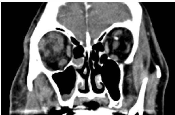
Fig. 6. Preoperative computed tomography depicts mucosal thickening of the right ethmoidal and maxillary sinus. Jin Yong Cho et al: Cavernous sinus thrombosis progression from trismus. J Korean Assoc Oral Maxillofac Surg 2015