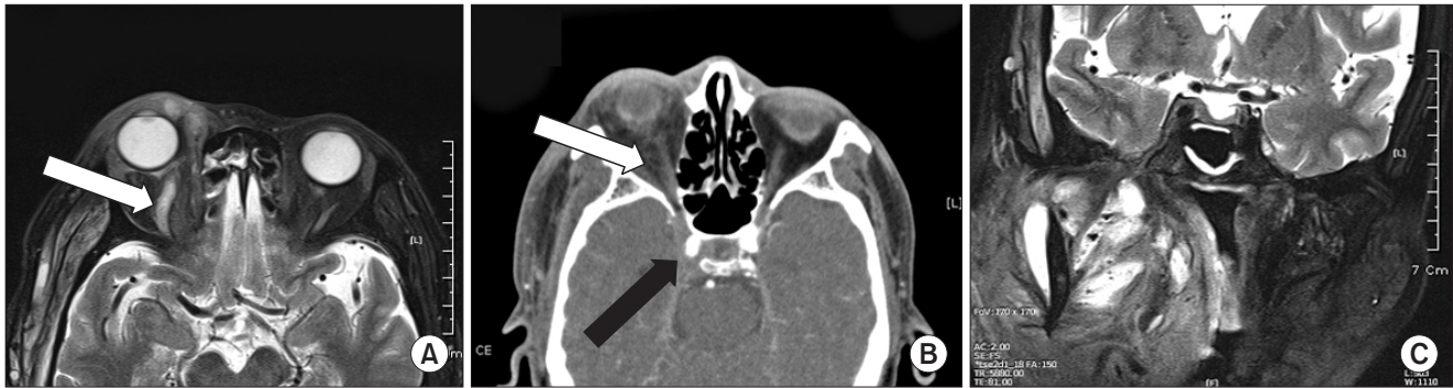
Fig. 5. A. Magnetic resonance imaging (MRI) demonstrates engorgement of the right superior ophthalmic vein (arrow). B. Computed tomography illustrates enhancement of the retrobulbar tissues (white arrow) and dilation of the right cavernous sinus (black arrow). C. MRI shows swelling of the lateral pterygoid muscle with pus formation. Jin Yong Cho et al: Cavernous sinus thrombosis progression from trismus. J Korean Assoc Oral Maxillofac Surg 2015