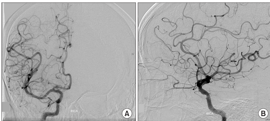
Fig. 4. Transfemoral carotid angiography of the right internal carotid artery (RICA). A. Anteroposterior view. B. Lateral view.

Jin Yong Cho et al: Cavernous sinus thrombosis progression from trismus. J Korean Assoc Oral Maxillofac Surg 2015