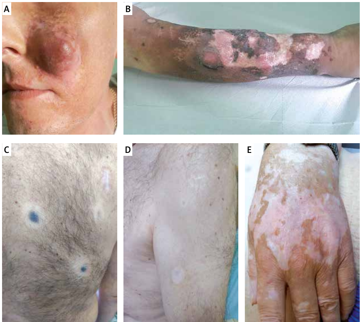
Figure 2. A – Vitiligo-like depigmentation after 6 months of anti-PD-1 therapy (CTCEA grade 1) within metastatic melanoma tumours on the face. B – Vitiligo-like depigmentation after 6 months of anti-PD-1 therapy (CTCEA grade 1) within the scar after excised primary melanoma lesion on the anterior surface of the left lower leg. C – Vitiligo-like depigmentation lesions within metastatic melanoma of the skin after a few months of anti-PD-1 treatment for metastatic melanoma. D – Vitiligo-like depigmentation lesions within selected melanocytic naevi after a few months of anti-PD-1 treatment for metastatic melanoma. E – Classical vitiligo-like depigmentation within the dorsal hands (CTCAE grade 1) that occurred after a few months of anti-PD-1 treatment for metastatic melanoma