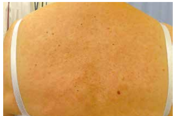
Figure 1. Maculopapular rash (CTCEA grade 2) in a patient treated with anti-PD-1, located in the neckline, back and shoulders, with onset in the 8 th week of treatment

The occurrence of maculopapular rash during anti-PD-1 inhibitor therapy is the most common adverse event and usually correlates with histopathological image typical of lichenoid dermatitis or interface dermatitis [17]. In some patients, papular lesions tend to spontaneously resolve approximately 8 weeks after the beginning of treatment, whereas lichenoid lesions may occur as