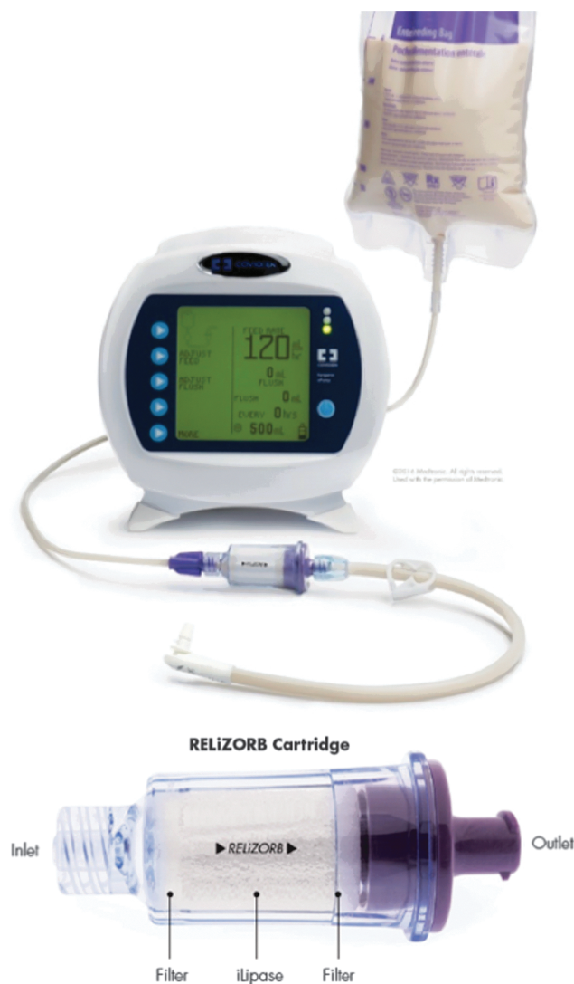
FIG. 1. Enteral feeding system and detail of RELiZORB enzyme cartridge.

acid plasma levels significantly below those of healthy individuals despite receiving EN for a mean 6.6 years. Results showed that use of the cartridge resulted in a statistically significant 2.8-fold increase in fat absorption vs. placebo, fewer reported GI events irrespective of PERT use, and improved tolerability vs. baseline (Figure 2). Investigators reported that use of the cartridge was associated with a 57% reduction in the incidence of diarrhea. In addition, more participants reported preservation of appetite and breakfast consumption when using the digestive cartridge compared with their pre-study regimens. This likely was because of an increase in fat absorption from EN and an associated decrease in the frequency and severity of symptoms of malabsorption.