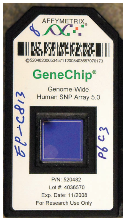
Fig. 2 Affymetrix microarray chip

The most widely used NGS technology, sequencing by synthesis (Illumina, San Diego, California, USA) allows entire human genomes to be sequenced within 24 h at low cost, with the sub $1000 genome barrier (X-prize) being achieved earlier this year. Other innovative technologies include single molecular real-time sequencing (PacBio® SMRT™; Pacific Biosciences, Menlo Park, California, USA), semiconductor sequencing (Ion Torrent™; Life Technologies, Paisley, UK) and nanopore sequencing (Oxford Nanopore, Oxford, UK). Until recently, NGS was limited to small studies on a few samples owing to cost constraints, but because of the rapid fall in price-per-sample (Fig. 3), large studies are now in progress. The Cancer Genome Atlas (TCGA) project is sequencing the cancer genome of 33 different cancer types in the US population; the 100 000 Genomes Project in the UK is undertaking to sequence 50 000 cancer genomes and 50 000 rare disease genomes over the next 5 years.