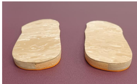
Figure 1. Innovative medial cushioned orthoses (IMCO) with medial cushioning casting filled with Poron (Microban).

IMCO was made with a flat sheet of 3 mm density and high hardness of ethylene-vinyl acetate (EVA) and with a medial cushioning casting placed from the bisectrix of the rear part of the orthotic to its medial edge, filled with viscoelastic rubber of Poron (Microban) [19]. Covering the superficial layer of the orthotic, 1 mm thickness of low hardness EVA was used (Figures 1 and 2). A flat sheet of 6 and 9 mm with the same design and materials were made to complete the IMCO.