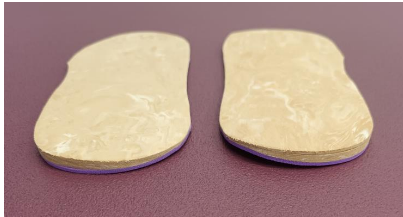
Figure 3. Typical lateral wedging orthoses (TLWO) with lateral enhancement of EVA on the rear side.