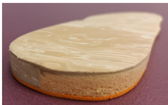
Figure 2. Detail of medial cushioning casting filled with Poron (orange material) set on rear-medial side of a left innovative medial cushioned orthotic (IMCO).

The TLWO was made with a flat sheet of 1 mm of ethylene-vinyl acetate (EVA) thickness of high hardness with a posting wedge of 3 mm EVA thickness, placed on the lateral rear of the orthotic (Figures 3 and 4). Other 6 and 9 mm lateral wedge postings were made to complete the TLWO.