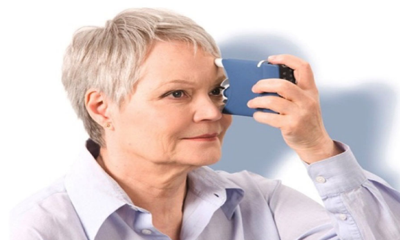
Fig. 1 Icare ® Home (Icare Finland Oy) self-monitoring device

There are two iCare models designed for self-monitoring that are currently available outside the USA, namely the iCare Home (Fig. 1) and its predecessor, the iCare One. Clinical trials have demonstrated that self-monitoring IOP measurements taken by iCare One have a strong correlation to