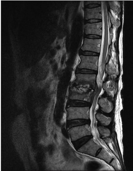
FIGURE 1. Sagittal T2-weighted magnetic resonance imaging shows diffuse bone marrow signal change, endplate destruction and epidural abscess formation at the L2–3 level.