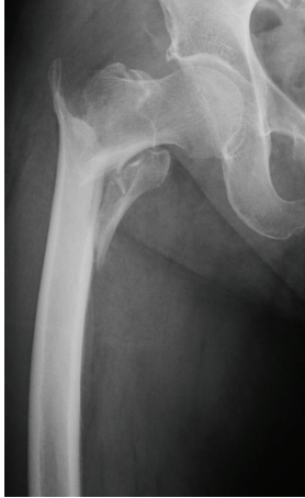
FIGURE 1: Radiograph showing an unstable trochanteric fracture of the right femur classified as 31-A2.2 according to the Orthopaedic Trauma Association classification.