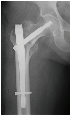
FIGURE 2: Radiograph showing insufficient reduction of the trochanteric fracture after implantation of the Gamma 3 nail.

nonunion and implant breakage [8, 15, 16]. Implant breakage is rare, and to our knowledge, only 2 previous cases of breakage of third generation Gamma nails have been reported, both of which were used to treat pathological trochanteric fractures [15].