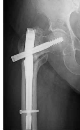
FIGURE 3: Radiograph showing nail breakage at the opening for the lag screw at 14 months after surgery. The fracture shows signs of nonunion with sclerosis of the bone ends.

An 83-year-old woman initially presented at another hospital with an unstable trochanteric fracture (Orthopaedic Trauma Association classification 31-A2.2) of her right femur after falling from a standing height (Figure 1). She was obese with a height of 148 cm, weight of 56 kg, and body mass index