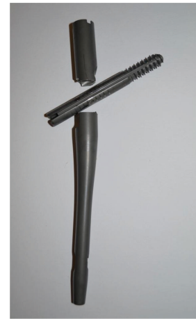
FIGURE 5: The retrieved Gamma nail, showing a horizontal fracture line at the opening for the lag screw.

intramedullary nails such as the Gamma nail are appropriate devices for the treatment of unstable trochanteric fractures, they are temporary implants with a limited life expectancy under continuous dynamic stress loads. In cases of delayed union or nonunion, metal fatigue caused by excessive dynamic stress can be expected [18]. Sufficient reduction to ensure stability is, therefore, necessary for unstable fractures. In the current case, the main cause of breakage of the Gamma nail was nonunion of the fracture due to insufficient reduction with varus position of the femoral head, so that the entry point of the nail was not at the tip of the greater trochanter, but at the fracture site lateral to the tip. The nonunion resulted in metal fatigue due to the continuous excessive load and eventual nail breakage. Other possible causes of breakage are the shortening of the end of the lag screw outside the lateral femur resulting in a longer