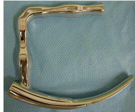
FIGURE 3: A rigid curved laryngoscope. This curved rigid laryngoscope can enable visualization of the whole oropharynx.

GGs is an important pathogen of deep neck abscesses. A rigid curved laryngoscope enables a wide viewing field and