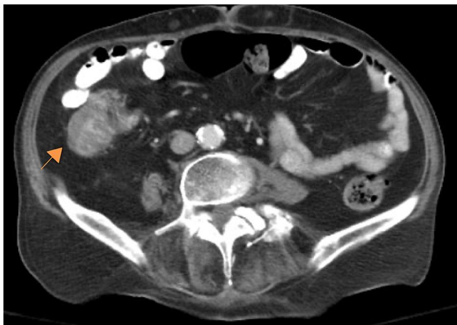
FIGURE 2: Axial CT image, with both IV and PO contrast, demonstrating thickened inflammatory changes in the ascending colon (orange arrow)

The patient was admitted with a presumptive diagnosis of neutropenic enterocolitis and was treated