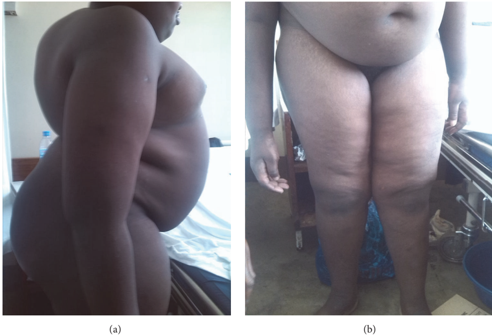
FIGURE 1: The clinical photos showed Kyphoscoliosis and truncal obesity (a) and poor developed genitalia (b) in a 25-year-old male with Prada-Willi Syndrome.

together with musculoskeletal deformity, like kyphoscoliosis and deranged hypoxic ventilator function, can lead to severe respiratory problems [3, 4].