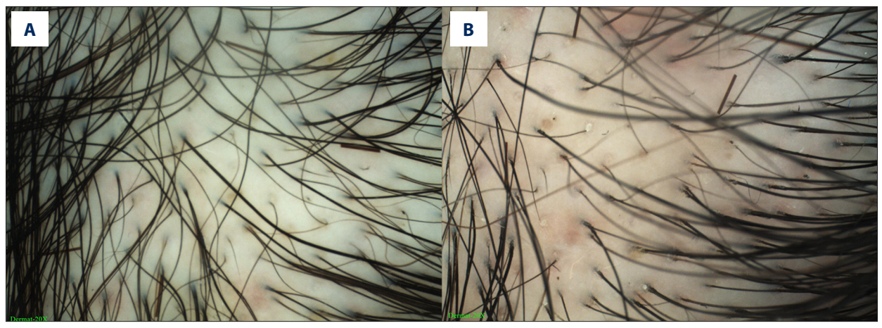
Figure 2. Dermatoscopy images of a 38-year-old FPHL patient showing shaft variability and yellow spots, created using Dermoscopy-II 2.0 software (Dermat Speedy Recovery T&D Co., Ltd, Beijing, China). (A) Frontal scalp using the Immersion model (20×); (B) Frontal scalp using the Polari-light model (20×).

12p12.1, and 18q12.3. The negative GWAS replication results in the Chinese population support the indication that femalepattern hair loss and male-pattern baldness are etiologically separate entities. Future genetic studies of FPHL should focus on systematic genome-wide approaches.