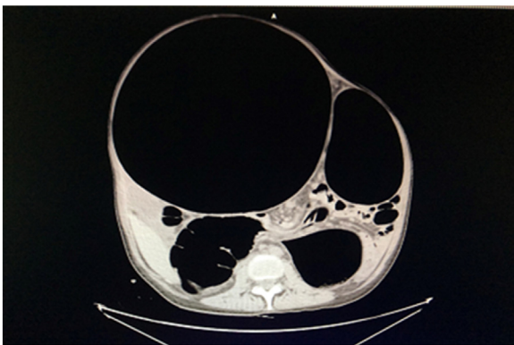
Fig. 3. Suspicious megacolon in CT-scan.

the sigmoid wall was free of necrotic features, the rectum was collapsed but no visible mechanical cause of obstruction was retrieved. Manual derotation of volvulus and execution of Hartmann's resection with temporary colostomy was subsequently operated.