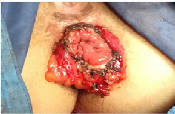
Fig. 6. Result of Duhamel procedure (first stage): the perineal colostomy.

6 cm pouch on the posterior wall of rectum. The left colon was pulled through the posterior wall of rectum, and Duhamel's perineal colostomy wrapping was performed (Fig. 6). A Jackson-Pratt aspirating drainage was left in the pelvis. The total operating time was 348 min.