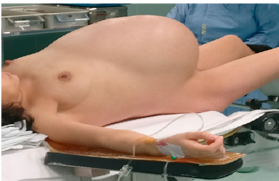
Fig. 2. Altered abdominal silhouette of the patient.