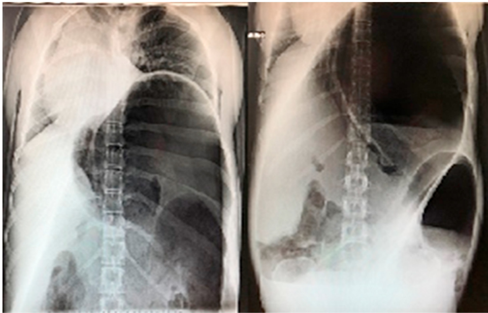
Fig. 1. Abdomen X-rays showed colonic obstruction.