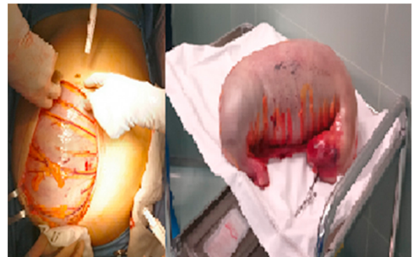
Fig. 4. Enormous sigmoid volvulus occupied all abdominal quadrants.