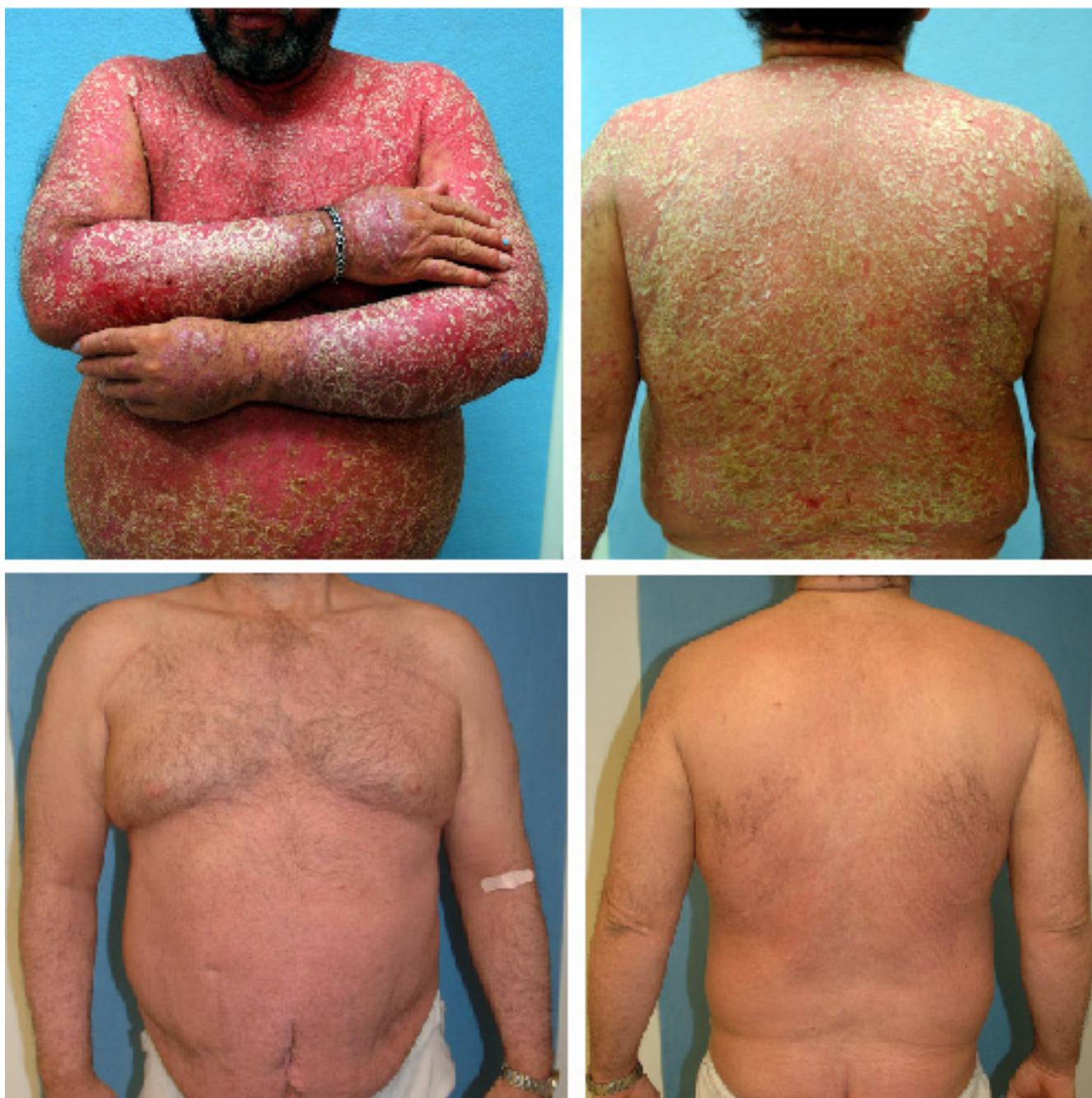
Figure 1 Clinical photos of patient 1 during the flare reaction in June 2004 (upper panels), with follow-up photos after standard-dose treatment with efalizumab for three months (lower panels).

associated with recurrence of her psoriasis. However, by June 2004 there was almost confluent severe plaque psoriasis again with features of erythroderma. The efalizumab