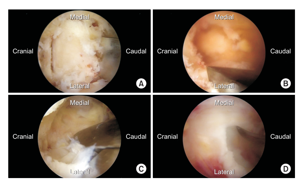
Fig. 1. Intraoperative arthroscopic images obtained during biportal endoscopic transforaminal lumbar interbody fusion. (A) Laminectomy using an osteotome for autologous bone harvest. (B) Ostectomy of the inferior articular process. (C) Removal of the foraminal ligament after facetectomy. (D) Disc incision using a biportal endoscopic specialized knife for discectomy.

Fourteen consecutive patients (six males and eight females) with degenerative lumbar diseases who were treated with BE-TLIF were enrolled in this study. The average patient age at the time of surgery was 68.7 \pm 8.5 years (range, 49 to 85 years). The causes of disease included eight patients with central spinal stenosis with foraminal stenosis, four patients with degenerative spondylolisthesis, and two patients with isthmic spondylolisthesis. On the level of operation, three cases were at L3–4, nine cases were at L4–5 and two cases were at L5–S1. The mean operative time was 169 \pm 10 minutes. The mean estimated blood loss (drainage blood) was recorded at 74 \pm 9 mL.