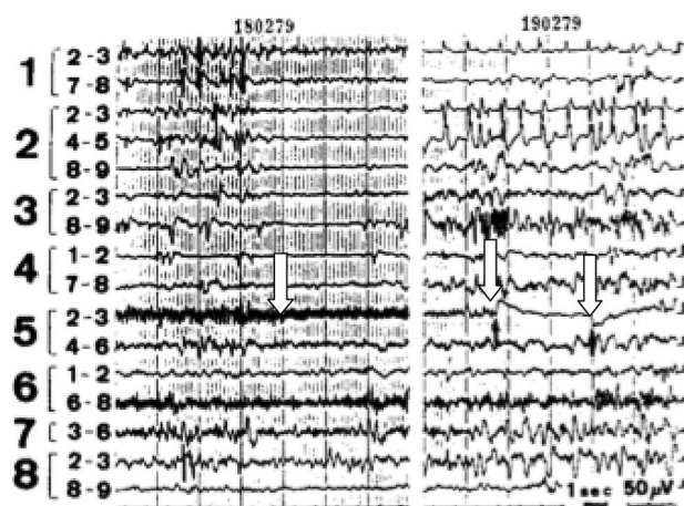
Fig. 2 Intracranial EEG showing seizure patterns concomitant with musical hallucinations: the spontaneous discharges in the gyrus of Heschl could be controlled only by very elaborate auditory stimuli. Left: the beginning of a Portuguese song changes the frequency of the epileptic discharge (see arrow). Right: a sudden interruption of the song (between arrows) suppressed and modified the otherwise continuous discharge (Wieser [21])