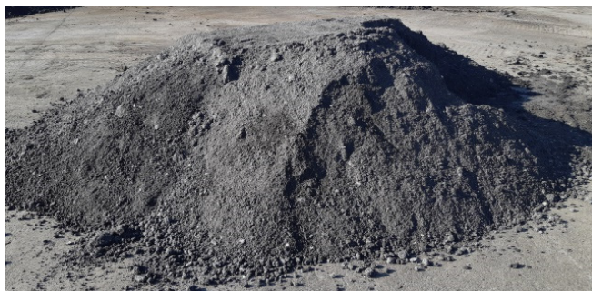
Figure 2. Stabilized municipal sewage sludge used in the investigation.

The municipal sewage sludge used for the experiment was collected from the municipal sewage treatment plant of the city of Zagreb and its quality met the Croatian State Standard for Agricultural Application of Municipal Sewage Sludge (Figure 2) [20]. The basic characteristics of the soil and municipal sewage sludge are presented in Table 9.