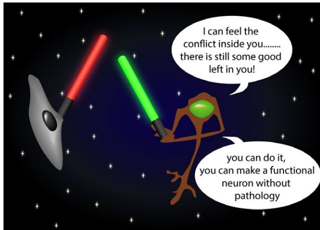
FIGURE 3 Schematic representation reflecting the struggle of developing safe and efficient protocols that prevent the reprogrammed cell product to revert back to its original state. An additional concern with autologous therapy is to exclude the expression of disease-related pathology in the converted neuron

awaiting the wide-scale application of safe and efficacious cell-based therapies. In both cases, only time will tell the outcome, but we dare to predict that the Force will be with us.