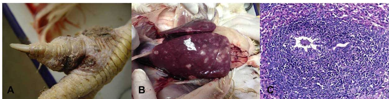
Fig. 1 Clinical symptoms and pathological lesions. a: Cysts appeared in the toes; b: tumors appeared in the liver; c: histopathological tissue (HE, 400×)

The pp38 gene encodes a phosphoprotein of approximately 38 kDa that is necessary for both cell transformation and viral reactivation in the latent period [6, 7]. The pp38 gene is conserved in all strains of MDV so far isolated. Previously, it was believed that pp38 was not present in MDV strain CVI988 [8], but in recent years, the gene was shown to be expressed by CVI988, and a mutation at residue 107 (Q → R) is identified with Mab H19 [9, 10]. In this study, we found no mutation at residue 107 of the PP38 protein of the isolated strain