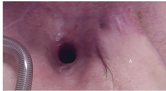
Fig. 3 Post-operative outcome – an external view of the neck and stoma. A Deltopectoral flap

pharyngocutaneous fistula, laterally in the neck, over the 3-point junction of the DP flap. In all patients this required no intervention, did not result in wound dehiscence, and closed spontaneously in a mean of 15 days post-operatively. For the three patients requiring adjuvant (chemo)radiotherapy, there was no delay in treatment delivery.