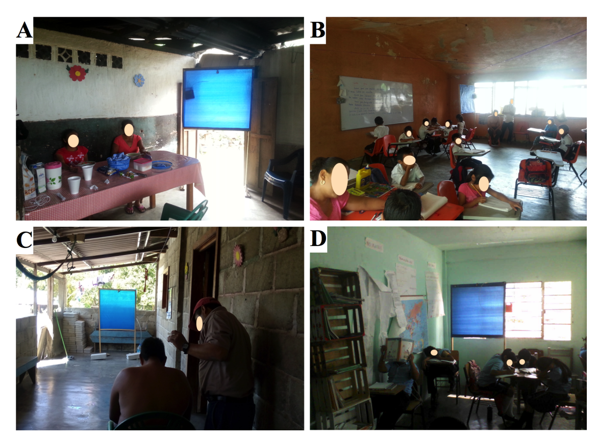
Fig 2. Position of EWT in the households and elementary schools. (A) In Las Golondrinas, the EWTs were deployed at the kitchen-dining area of the household and (B) at the rear of the classroom of the elementary school. (C) In Jose Maria Morelos, the EWTs were deployed at the living room area of the household and (D) at the rear of the classroom of the high school.

In the Las Golondrinas household two EWTs were located near the door to the home. The HLC was located approximately 2m from the traps and there were 5-7 residents present in the home during the course of the study (Fig 2A). In the Las Golondrinas school room the HLCs were carried out approximately 1 to 2 m from the EWTs, which were located at the front of the