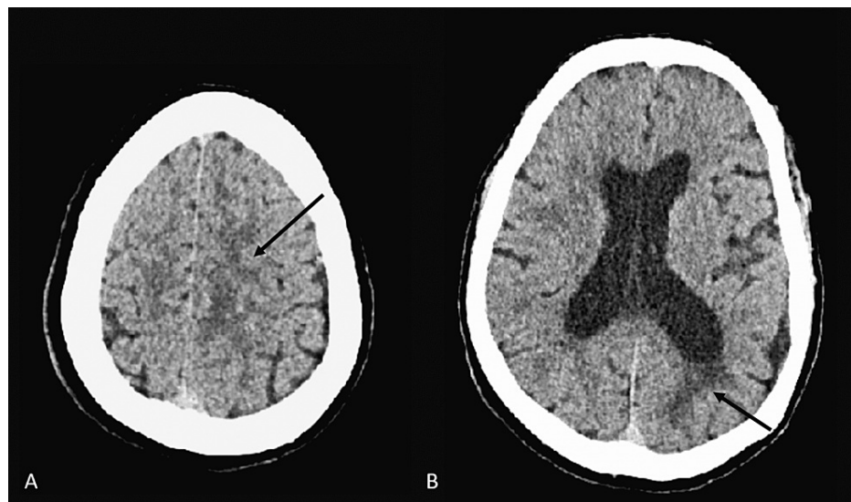
FIGURE 1: Computed tomography scan of the brain without contrast

(A and B) Axial images showing mild to moderate hypodensities in left frontal and occipital lobes, suggestive of white matter disease (arrows).