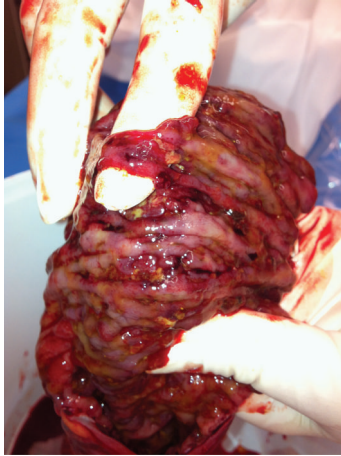
FIGURE 1: Extensive ulceration affecting the descending and sigmoid colon.