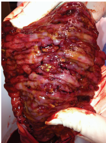
FIGURE 2: Postoperative specimen.

Shigella invades colonic enterocytes and specialised epithelial M cells overlying lymphoid follicles and induces an intense inflammatory response, leading to the death of epithelial and immune cells, colonic mucosal ulceration, and abscesses [3]. Shigella strains elaborate chromosomally encoded ShET1 enterotoxin, virulence plasmid-encoded ShET2 enterotoxin, and Shiga toxin. They are less susceptible to acid than other bacteria; as few as 10 to 100 organisms are capable of causing bloody mucoid diarrhoea, abdominal cramps, and high fevers [4].