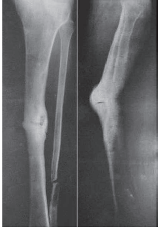
Figure 4 – Treatment of tibial pseudarthrosis using bioceramic

osteoinductive and osteogenic properties. However, they have limitations resulting from donor site morbidity, considerable risk of infection and other limiting factors such as pain, reabsorption, loss of volume, need for new intervention, greater duration of surgery, greater bleeding and limited quantity.