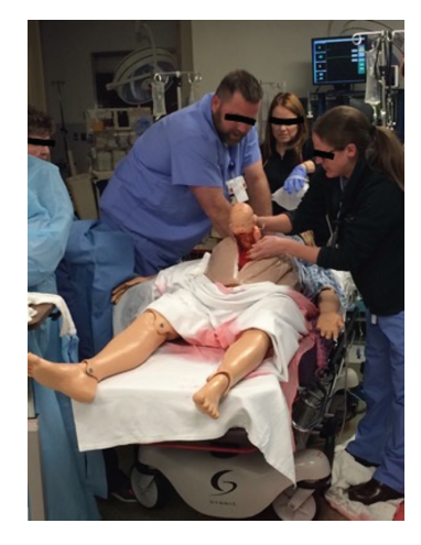
FIGURE 3: Residents performing emergent perimortem cesarean section.

Residents performed a perimortem cesarean section during all simulations. However, we observed an unexpected trend with almost all groups choosing to perform a Pfannenstiel skin incision and a low transverse uterine incision, contrasting with the current practice guidelines that favor a midline vertical incision (see Figure 3). Residents reported feeling they would be more proficient and could expedite delivery using this approach. This decision-making process has been supported in the literature by other authors [18, 19]. Group debriefing highlighted the advantages of a midline abdominal incision particularly for cases of abdominal