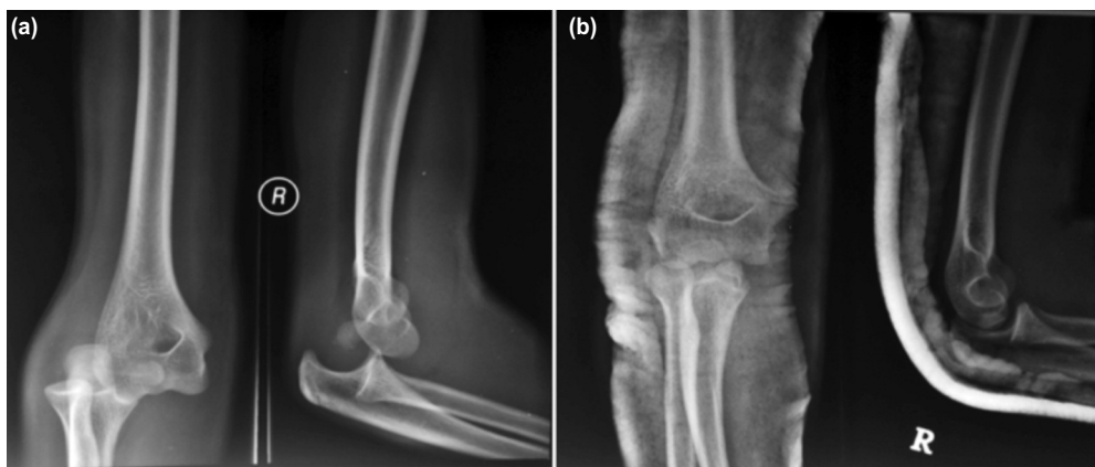
Fig. 1: (a) Right elbow radiograph showing right posterolateral elbow dislocation with intraarticular entrapment of medial humerus epicondyle avulsion fracture fragment in the elbow joint. (b) Medial humerus epicondyle fracture fragment remained entrapped in the elbow joint after closed manipulative reduction.