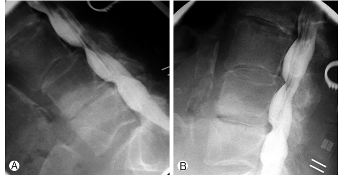
Fig. 1. Flexion-slip and compression (A) and extension-reduction with reduced stenosis (B) myelography displaying dynamic compression.

however this is theoretically limited due to its supine, static nature. MRI may display high quality imaging of the supine patient, however it does not provide information on what is happening to the spinal anatomy when the patient experiences pain,