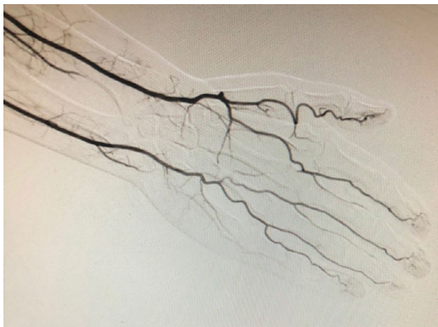
FIGURE 2 Left hand angiogram. This angiogram was obtained for one patient in the series. The angiogram demonstrates the lack of a superficial arch and the deep palmar arch is diminutive, suggesting that hand perfusion is co-dominant between the radial and ulnar blood supplies. However, a radial forearm flap was successfully harvested for this patient after surgical Allen's test