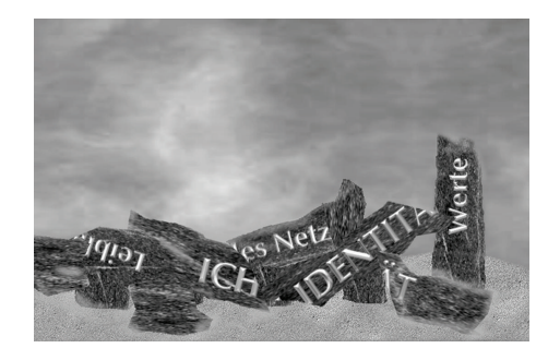
FIGURE 2: Broken pillars of identity (own drawing).

identity areas, one's own important individual experiences are shared with other people. These shared experiences of the people who tell the stories mutually influence their identities for the future. Metaphorically speaking, the five identity areas are called "pillars" (Figure 1) on which a human being's identity is based. The identity areas merge, and one area influences the other. The pillars are to be seen in a gender-specific manner [20–22].